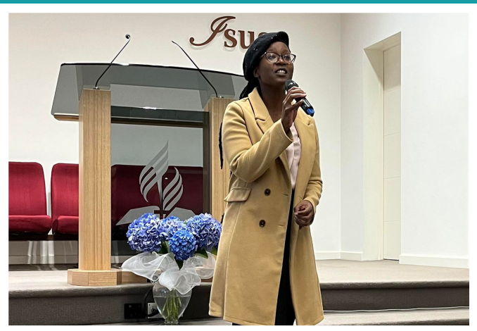
We were blessed with special items from talented women who wanted to praise God.