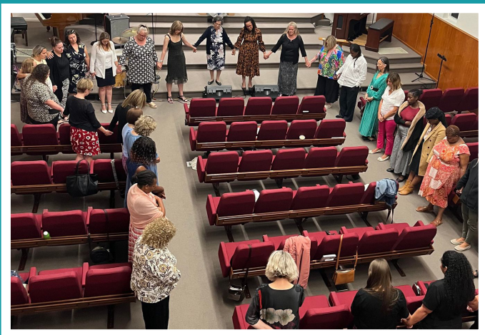
Uplift ended each session with a Prayer Circle, opening the floor for ladies to pray for each other.