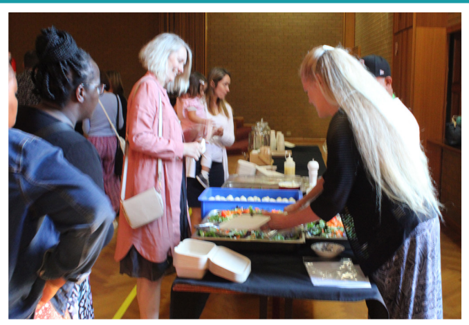
Refreshments were provided so ladies could fellowship over food and get to know each other.