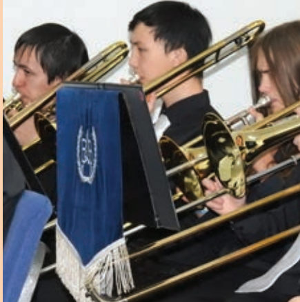
Advent Brass is a great opportunity for young musicians to develop their talents