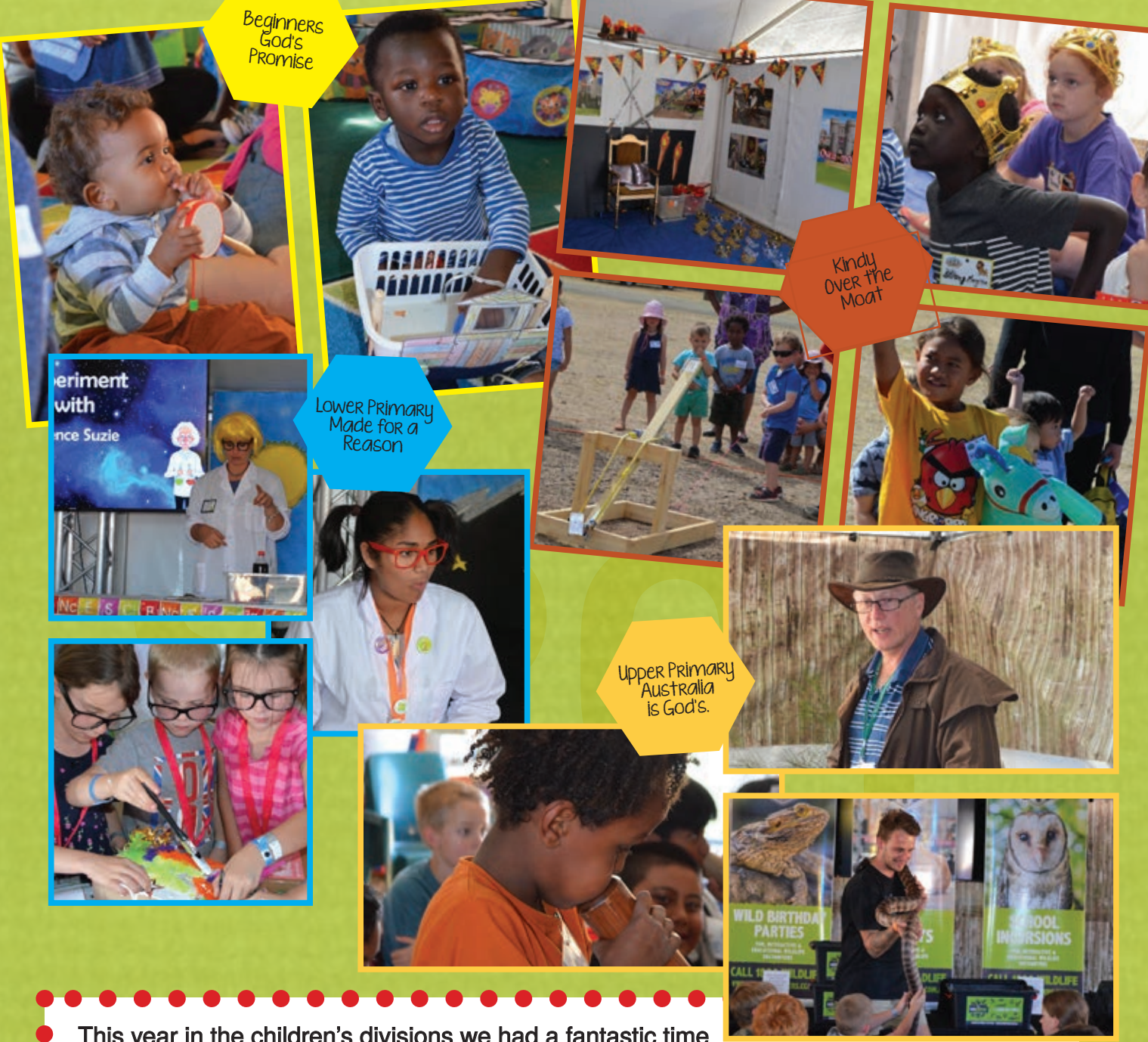
Beginners God's Promise