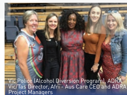
Vic Police (Alcohol Diversion Program), ADRA Vic/Tas Director, Afri - Aus Care CEO and ADRA Project Managers

Both the Black Rhinos and Peregrine Falcons participated at the ADRA Basketball Tournament on May 19th.