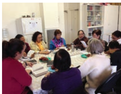
The Women of Werribee church meet every Wednesday, strengthening their relationships with each other and with God.