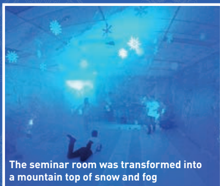
The seminar room was transformed into a mountain top of snow and fog