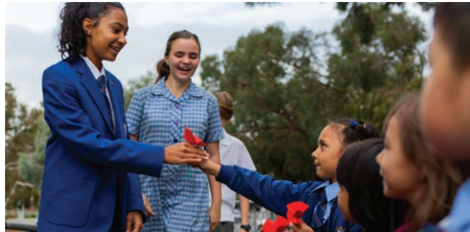
Clockwise from top left: Heritage College featured in the Herald Sun for NAPLAN improvement; Edinburgh Elite Basketball Academy; Gilson College food collection for ADRA; Henderson College students in Canberra; NCC Prep students giving out handmade poppies for ANZAC ceremony