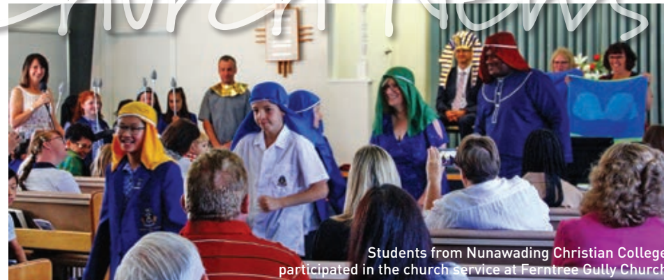
Students from Nunawading Christian College participated in the church service at Ferntree Gully Church