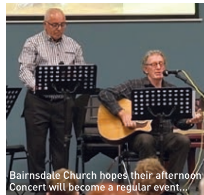
Bairnsdale Church hopes their afternoon Concert will become a regular event...