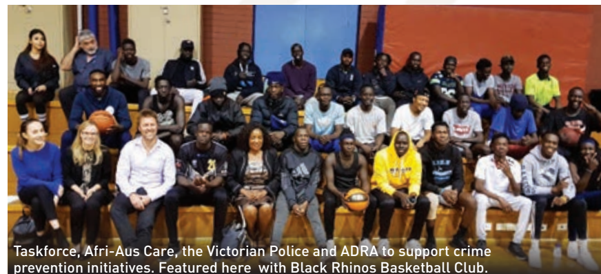
Taskforce, Afri-Aus Care, the Victorian Police and ADRA to support crime prevention initiatives. Featured here with Black Rhinos Basketball Club.