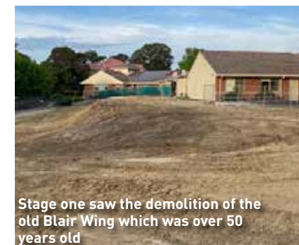
Stage one saw the demolition of the old Blair Wing which was over 50 years old

We have also increased the range of internal activities for the residents