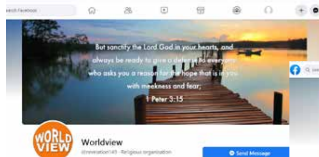
Two of the new initiatives that were started in 2020