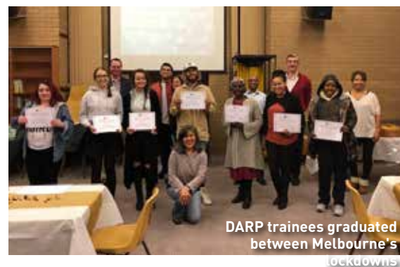
DARP trainees graduated between Melbourne's lockdowns