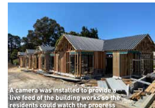
A camera was installed to provide a live feed of the building works so the residents could watch the progress