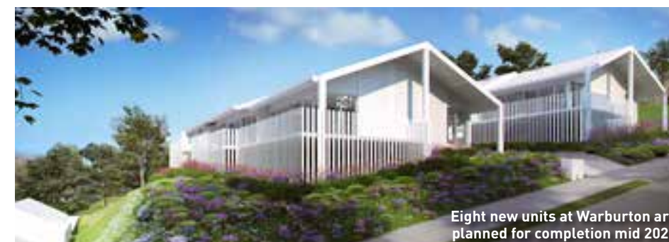
Eight new units at Warburton are planned for completion mid 2021