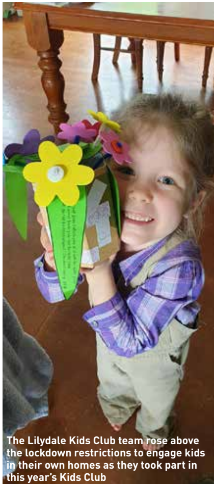
The Lilydale Kids Club team rose above the lockdown restrictions to engage kids in their own homes as they took part in this year's Kids Club