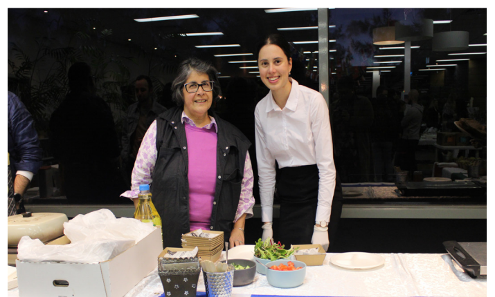
SERVICE WITH A SMILE: Food that is made with love will always taste good!