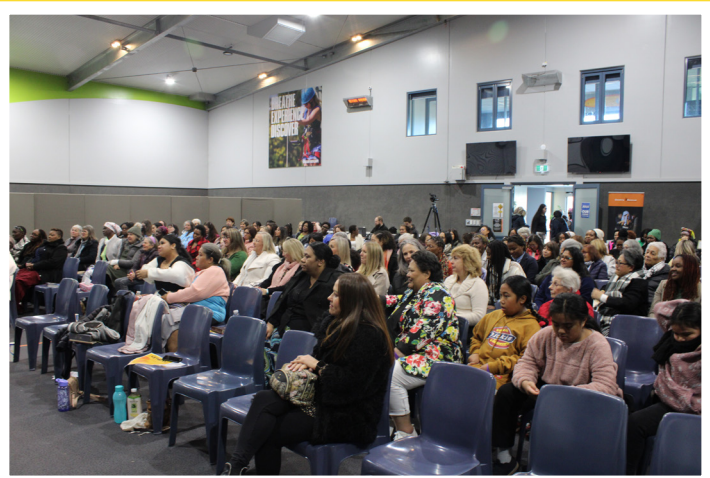
EXCELLENT ATTENDANCE: Lots of ladies braved the breeze of Phillip Island to be part of our women's weekend!