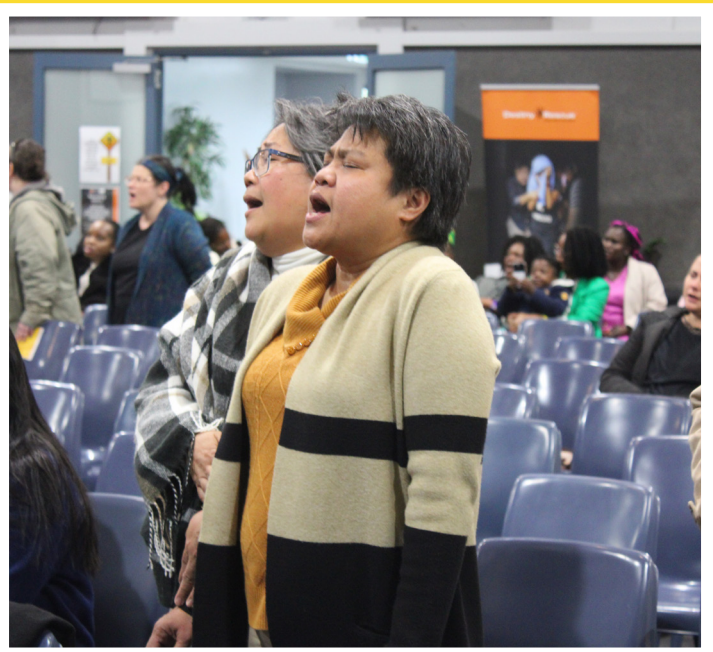
PASSIONATE PRAISE: Thanks to our amazing worship team, we gave glory to God by singing our hearts out!