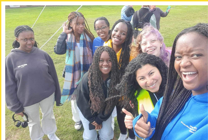
WE'RE SOARING, FLYING: On Sunday morning our young girls and teens took turn riding the fast flying fox!