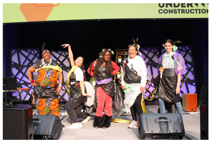
FROM CLEANING A MESS TO MAKING A DRESS: Five teams channelled their inner fashion designer when challenged to make a gown out of garbage bags!