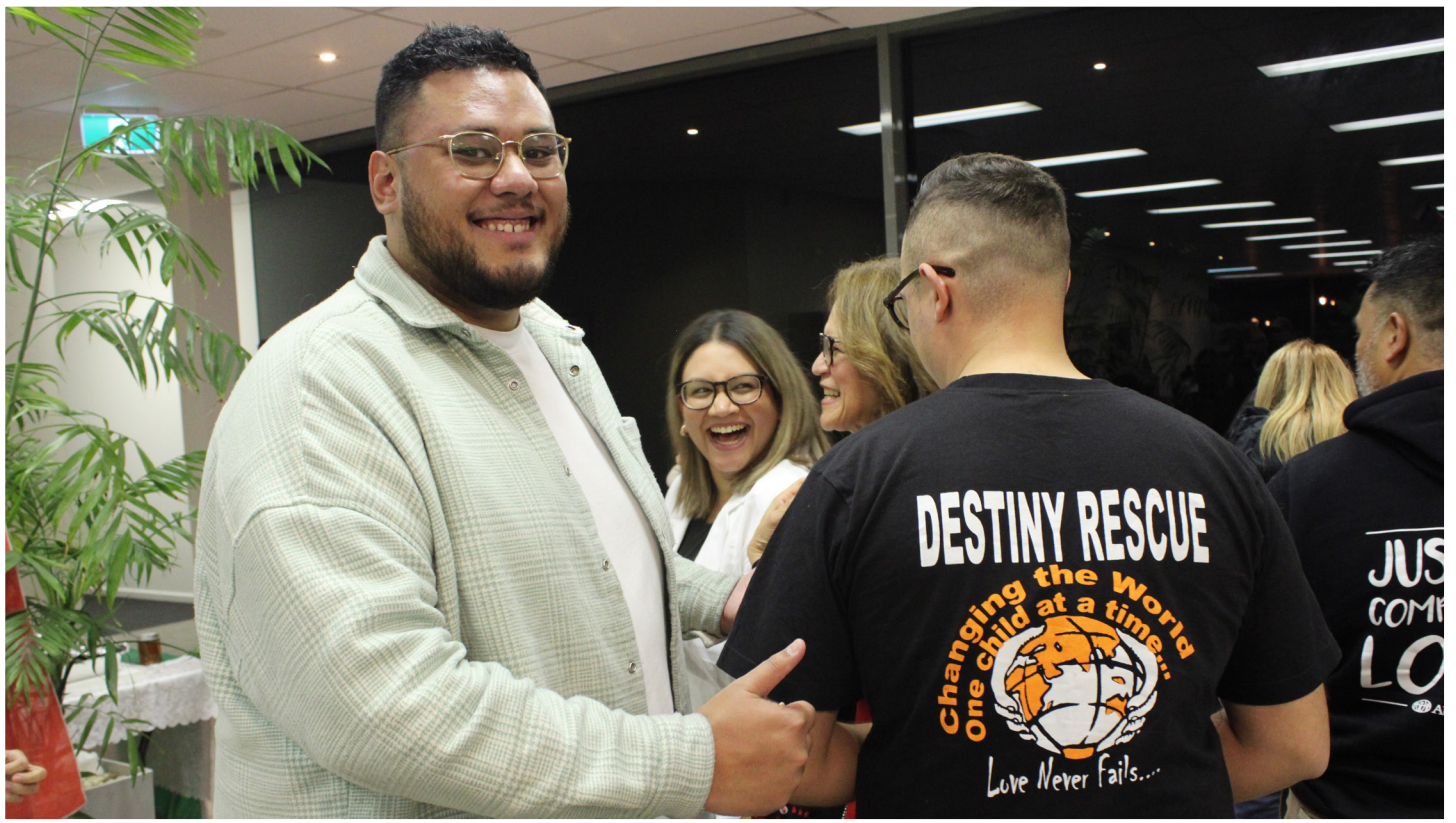
FOR A GOOD CAUSE: Everyone who attended was excited to support Destiny Rescue!