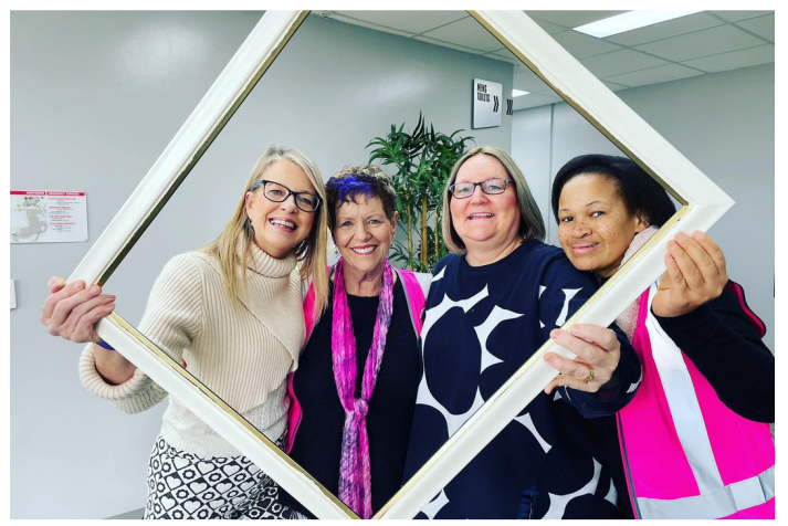
FREEZE FRAME: The wooden frame saw many having fun and capturing their memories!