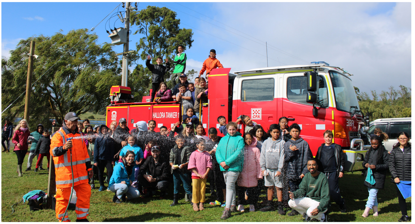
POWER WASH: Junior Tent got a fiery surprise while they washed cars for their ADRA fundraiser!