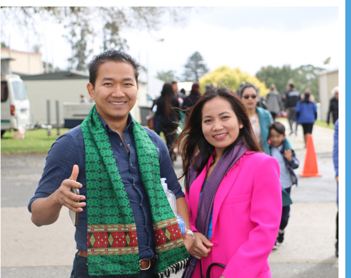
HAPPY CAMPERS: Even though the skies were grey, there was always a smile to brighten the day!