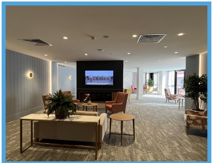
LOUNGING IN LUXURY: Our spacious community areas are perfect for social conversations or quiet time.