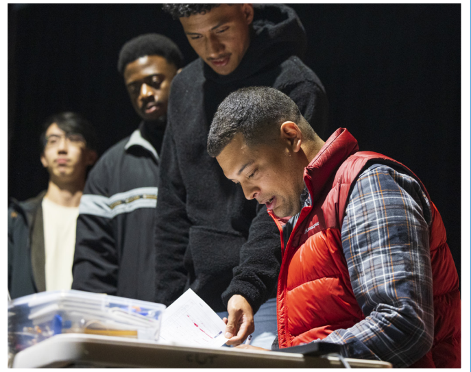
IT'S TRICKY: Youth Tent put their knowledge to the test as they try to answer trivia questions!