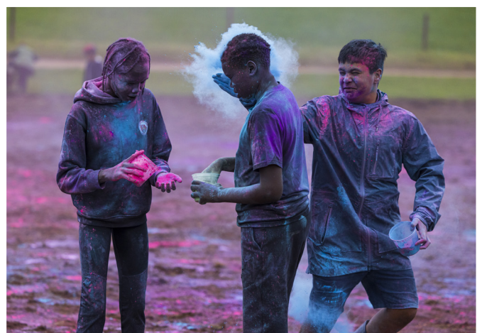
TRUE COLOURS: High School Tent let loose on during a chaotic colour run on the open campground!