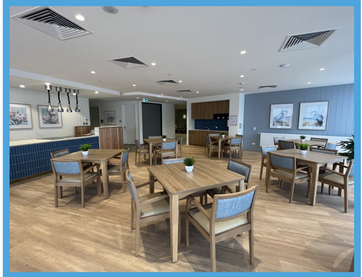
A DESIGNER DINING EXPERIENCE: Our residents enjoy their daily meals in our new colourful dining rooms.