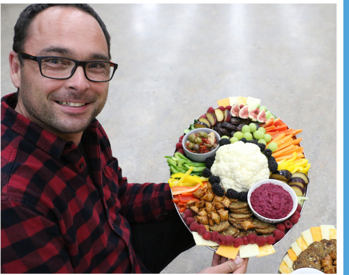
FEELIN' FRESH: The ADRA Veggies and Connections Tent shared crisp and crunchy camp snacks!