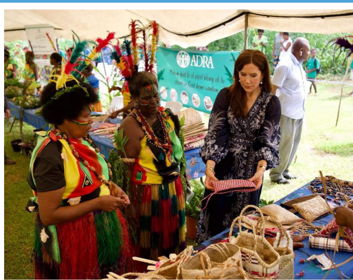
A Royal Visit: Princess Mary spends time at the Elang Family Support Services Centre

volunteering at the ADRA Carrum Downs Samoan SDA Church