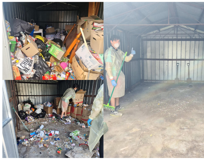
Backyard Blitz: Members from Nunawading, Burwood, Wantrina and Lilydale all helped out!