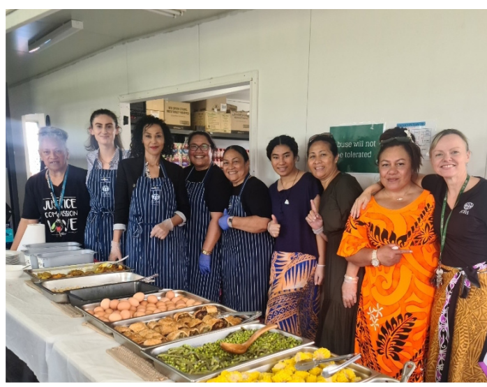
Cultures Combine: Praise God for the compassionate community of volunteers at Carrum Downs