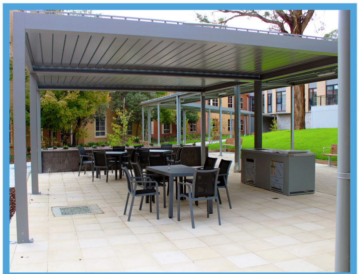
GREAT ROOMS AND GARDEN VIEWS: Our rooms come with an ensuite and a TV, and our new outdoor space is perfect for gatherings in the open air.